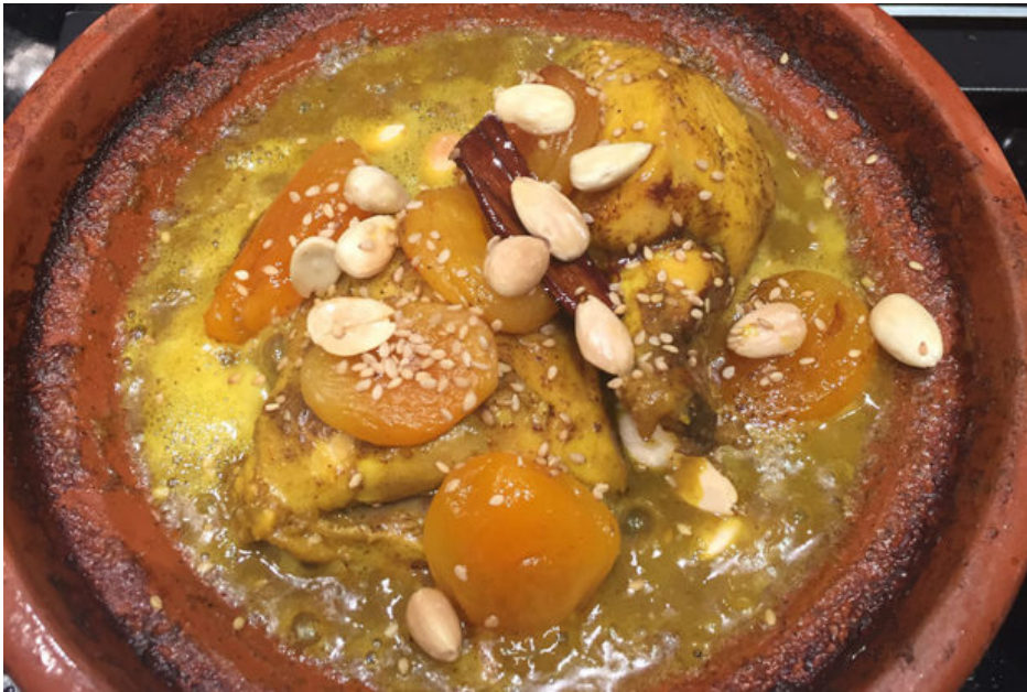
Tagine cooked at La Maison Arabe in Marrakech

White Barn Inn, Auberge Resorts Collection is Kennebunkport, Maine 's most charming location for a weekend getaway. Guests learn how to prepare classic comfort food, which in Maine means plenty of freshly caught lobster and seafood.