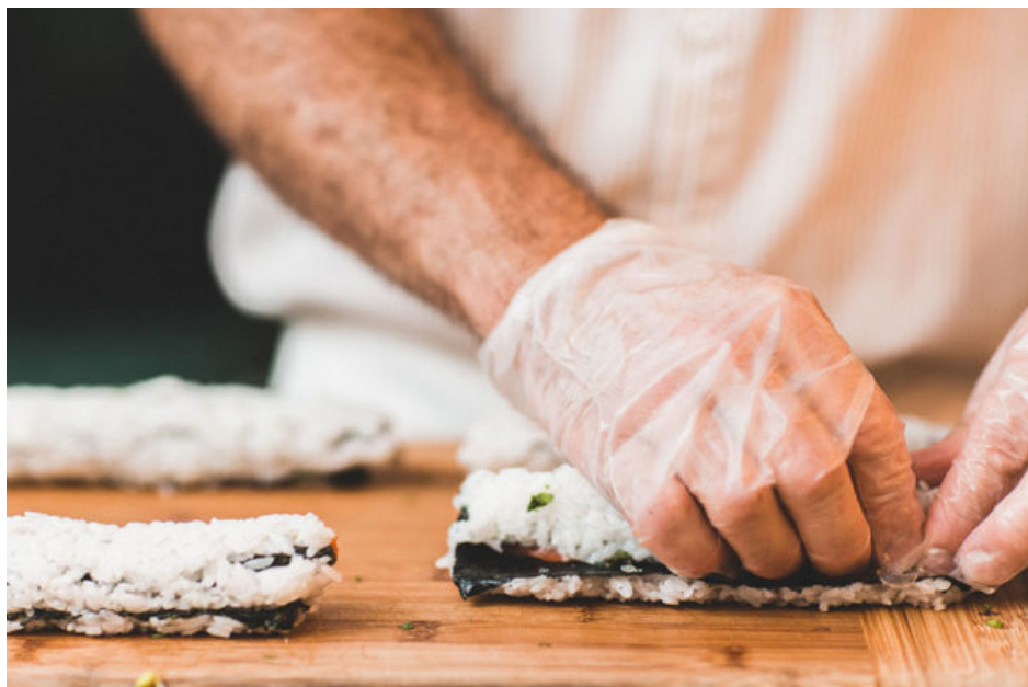
Sushi making in Kyoto

At Sonoma's off-the-beaten-path wine country hideaway, guests can take part in a private, full-day lesson in the Farmhouse's Michelin -starred kitchen, working alongside a chef as they prepare and cook a three-course dinner.