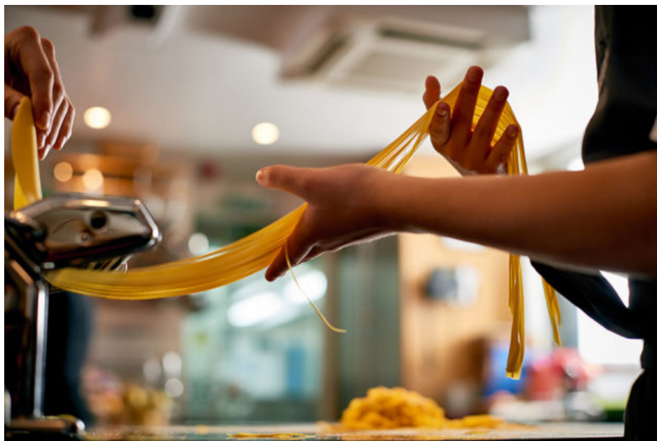
Spaghetti-making at Belmond Le Manoir Aux Quat Saisons, near Oxford

Le Manoir Aux Quat Saisons, just 30 minutes outside of bustling Oxford, feels like a countryside journey back in time. The Raymond Blanc Cookery School, named for the property's Michelin -starred chef, dives into the intricacies of multi-course cooking and hones in on elements like sauces and stocks.