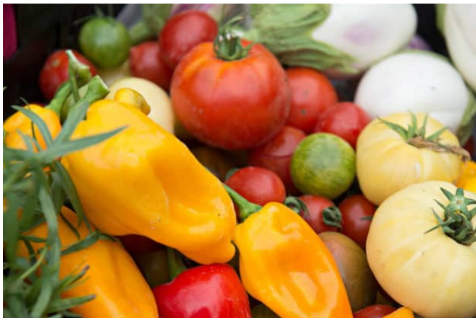
Vegetables at Ballymaloe, East Cork

Charleston's Zero George Hotel flawlessly marries traditional architecture with a contemporary aesthetic. Cooking courses are hosted in the property's 200-year-old Carriage House on Mondays and Saturdays, during which guests prepare inventive, southern-inspired dishes with the assistance of James Beard Award winners.